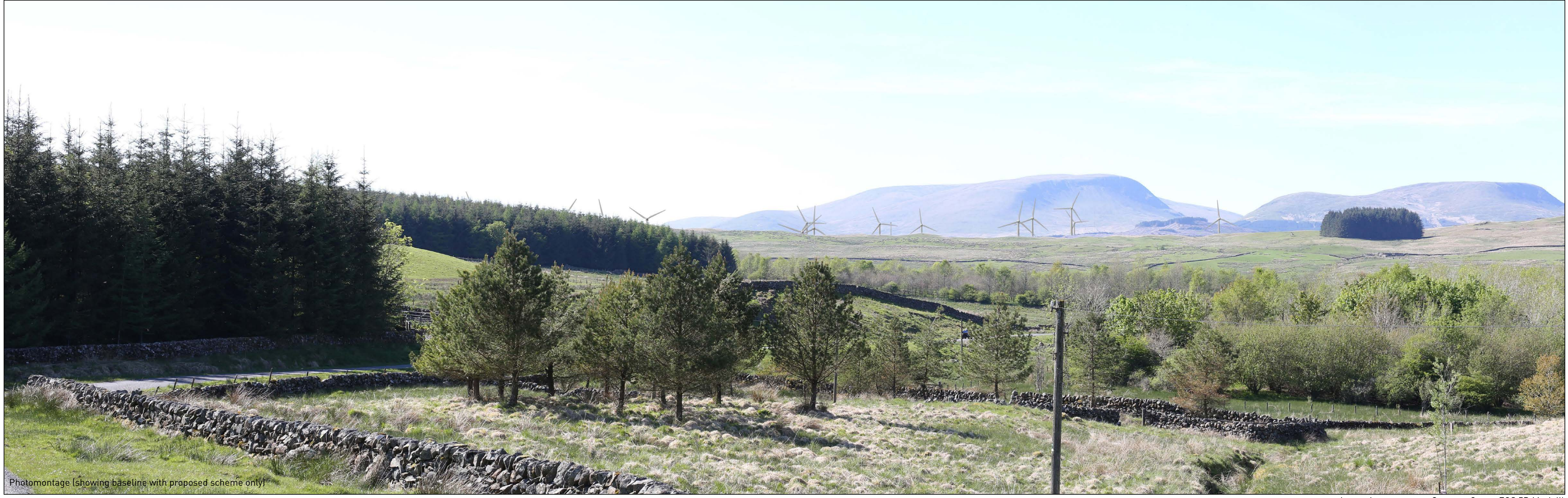
Figure 8.39 (sheet C) Viewpoint 3: Guttery Glen SHEPHERDS' RIG WIND FARM